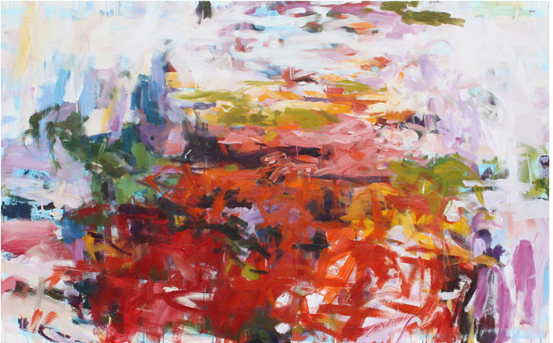
Karen Silve, From My Window , 2015 acrylic on canvas, 42 x 68 inches