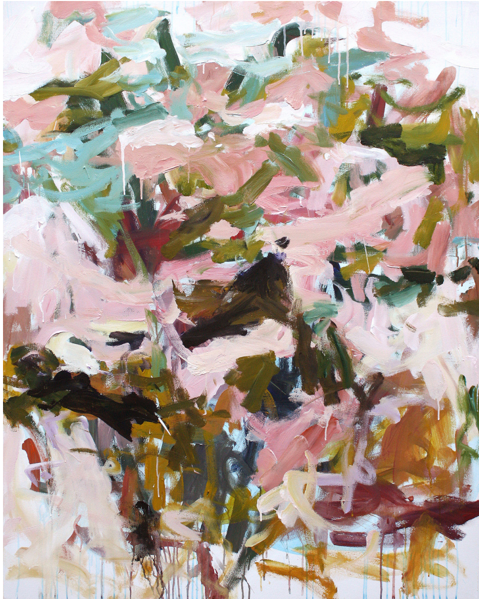
Karen Silve, Pink Ripples , 2017 acrylic on canvas, 58 x 46 inches