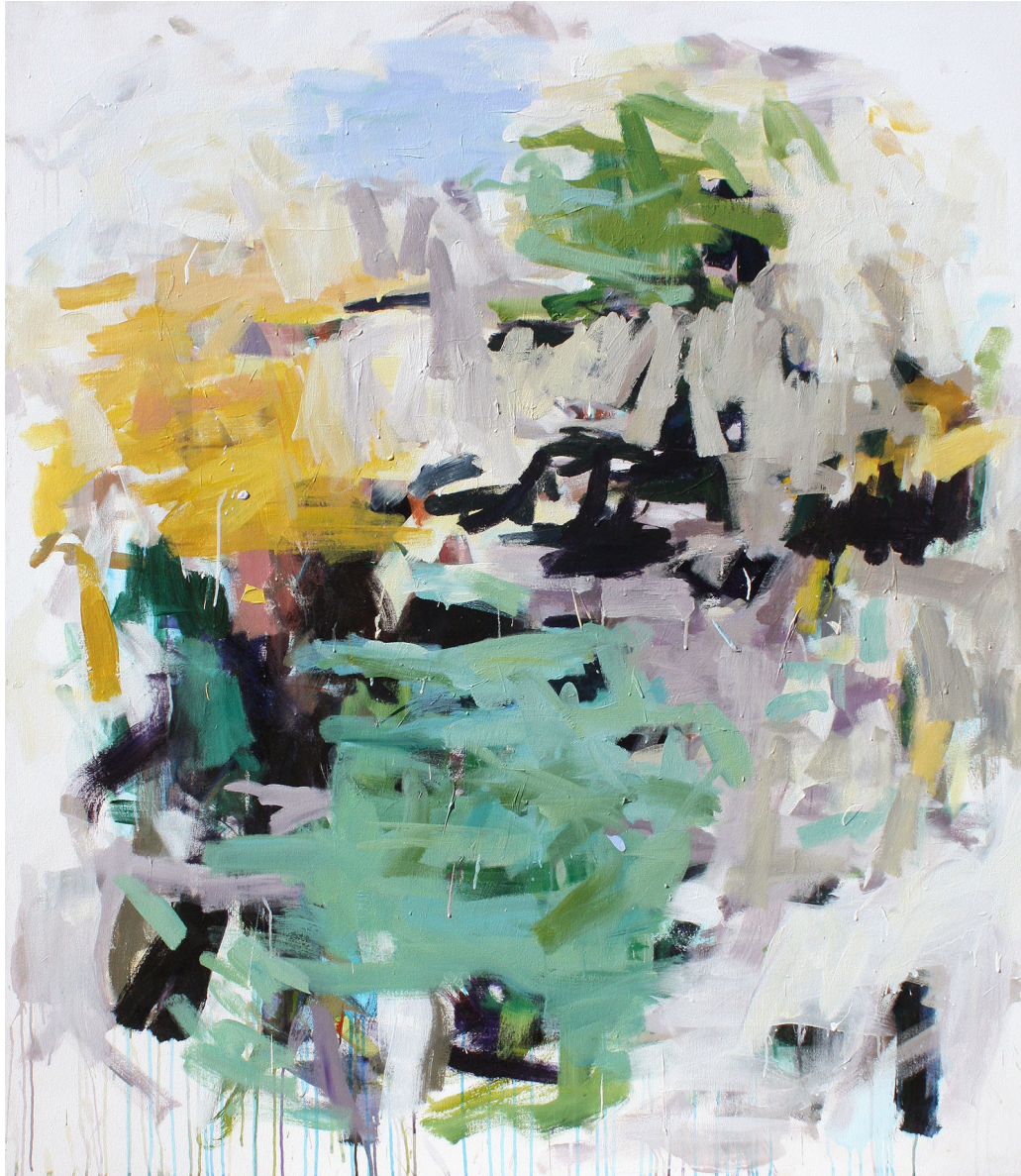
Karen Silve, Coalescence II , 2018 acrylic on canvas, 68 x 58 inches