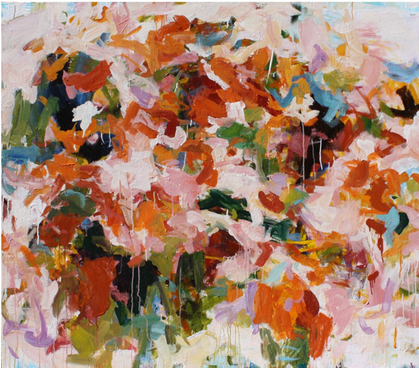
Karen Silve, Remembering Yesterday , 2015 acrylic on canvas, 50 x 58 inches