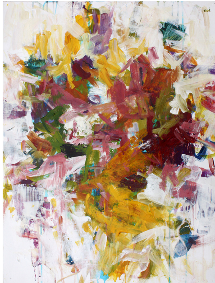
Karen Silve, Attraction II , 2013 acrylic on paper, 30 x 22 inches (frame size 36 x 28 inches)