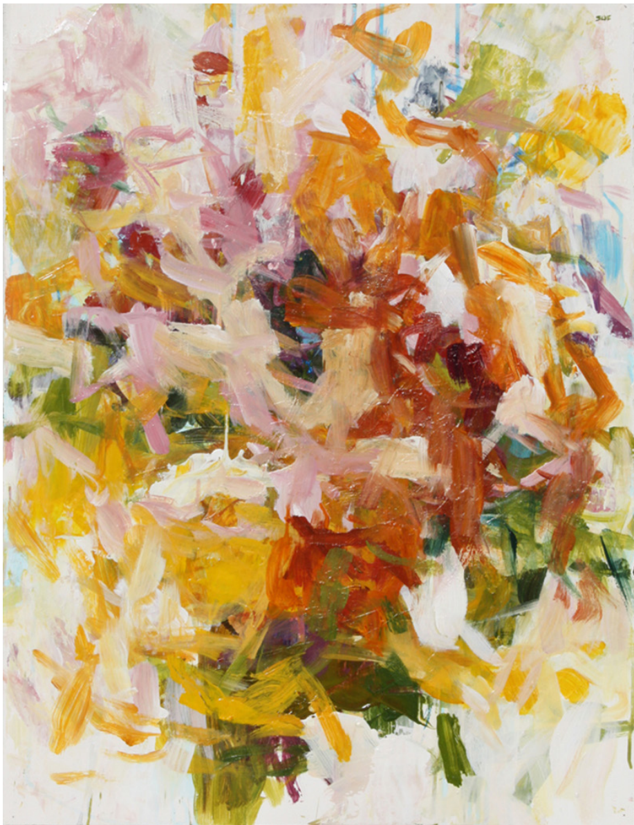
Karen Silve, Amorphous , 2013 acrylic on paper, 30 x 22 inches (frame size 36 x 28 inches)