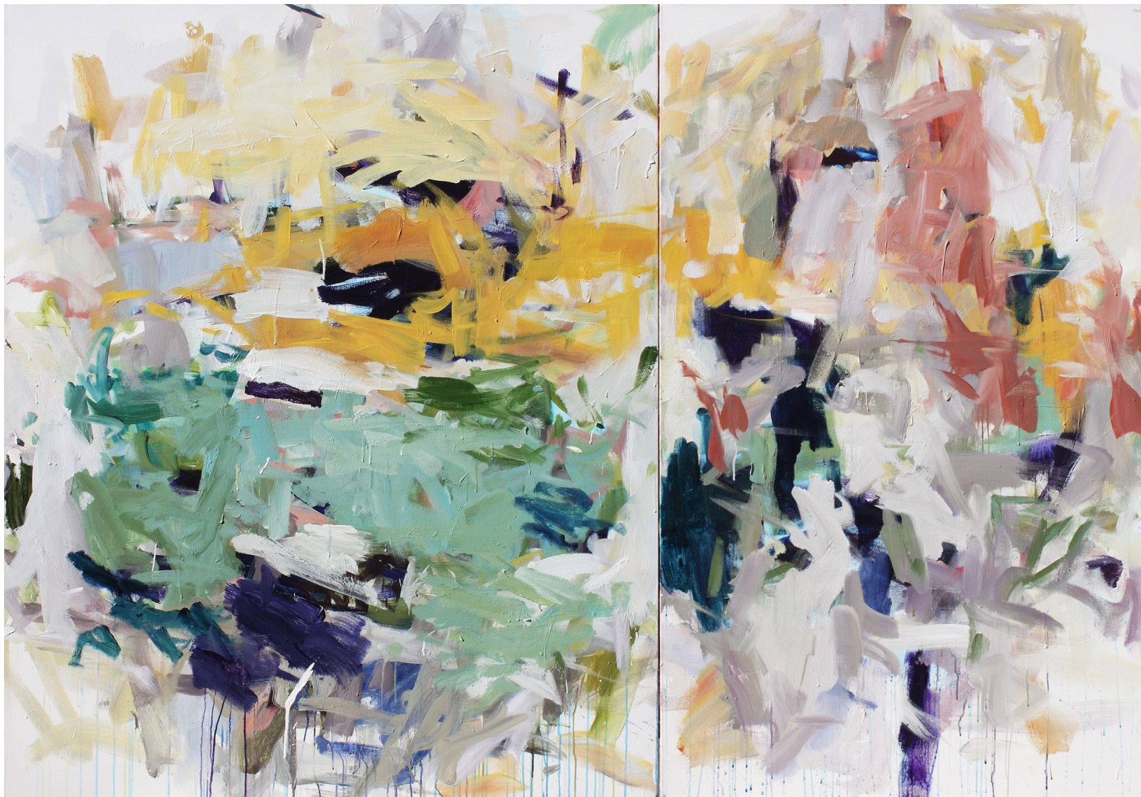
Karen Silve, Coalescence , 2018 acrylic on canvas, 60 x 84 inches