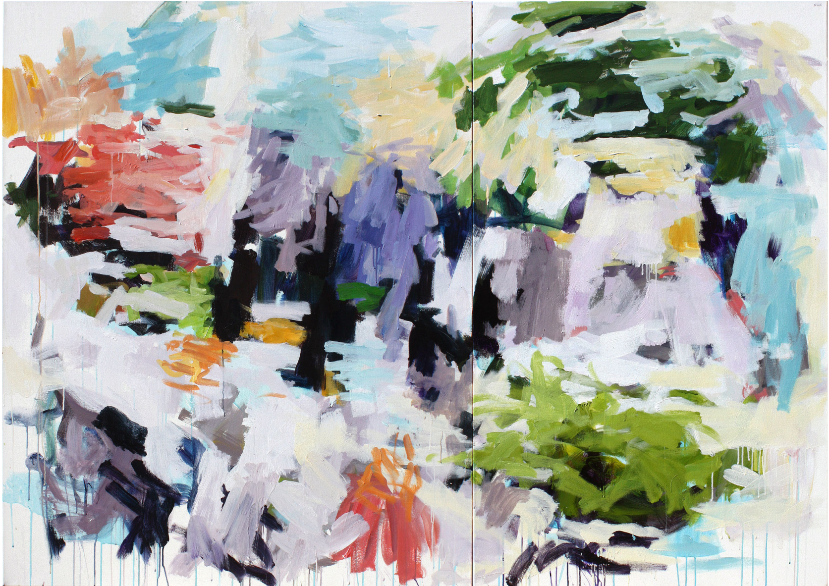
Karen Silve, Conversations , 2018 acrylic on canvas, 60 x 84 inches