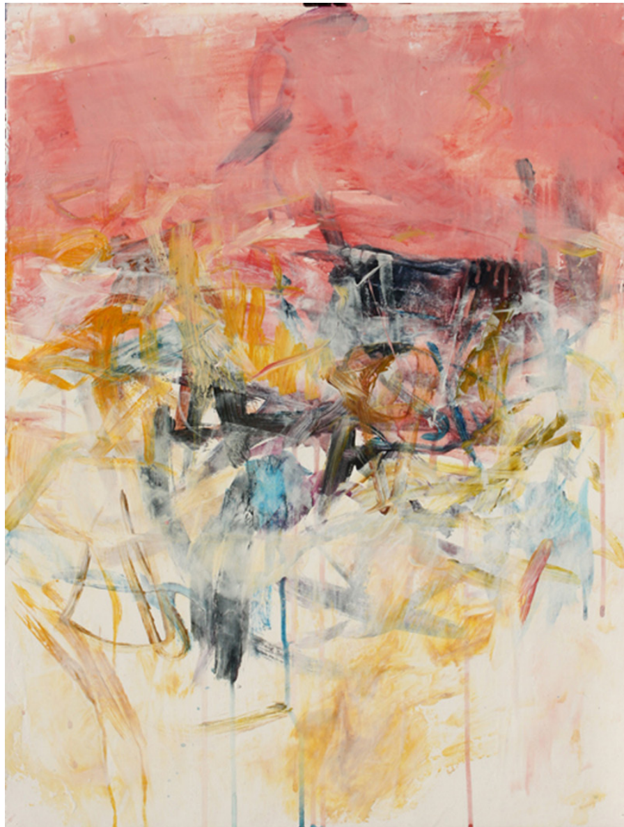
Karen Silve, Market Place Pink , 2012 acrylic on paper, 26 x 20 inches (frame size 30 x 24 inches)