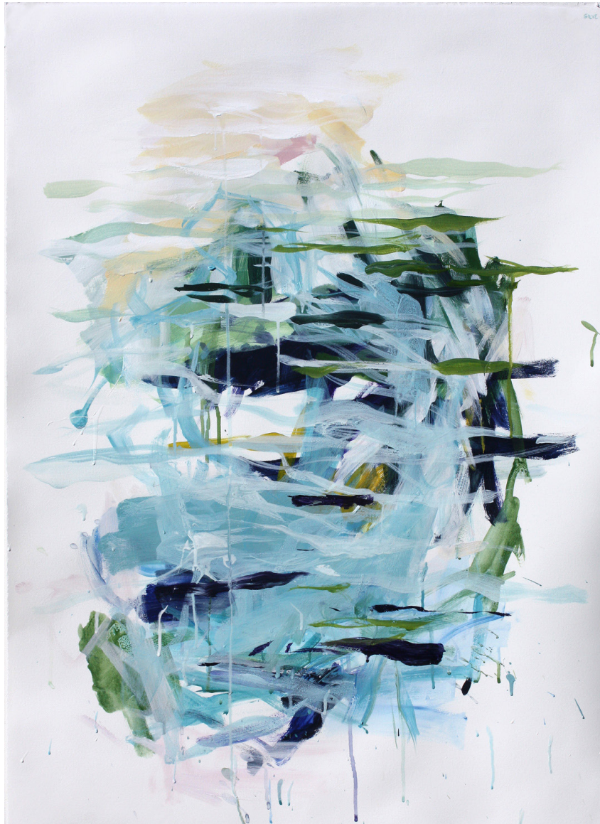
Karen Silve, Reverberations , 2017 acrylic on paper, paper size 42 x 30 inches (frame size 51 x 38 inches)