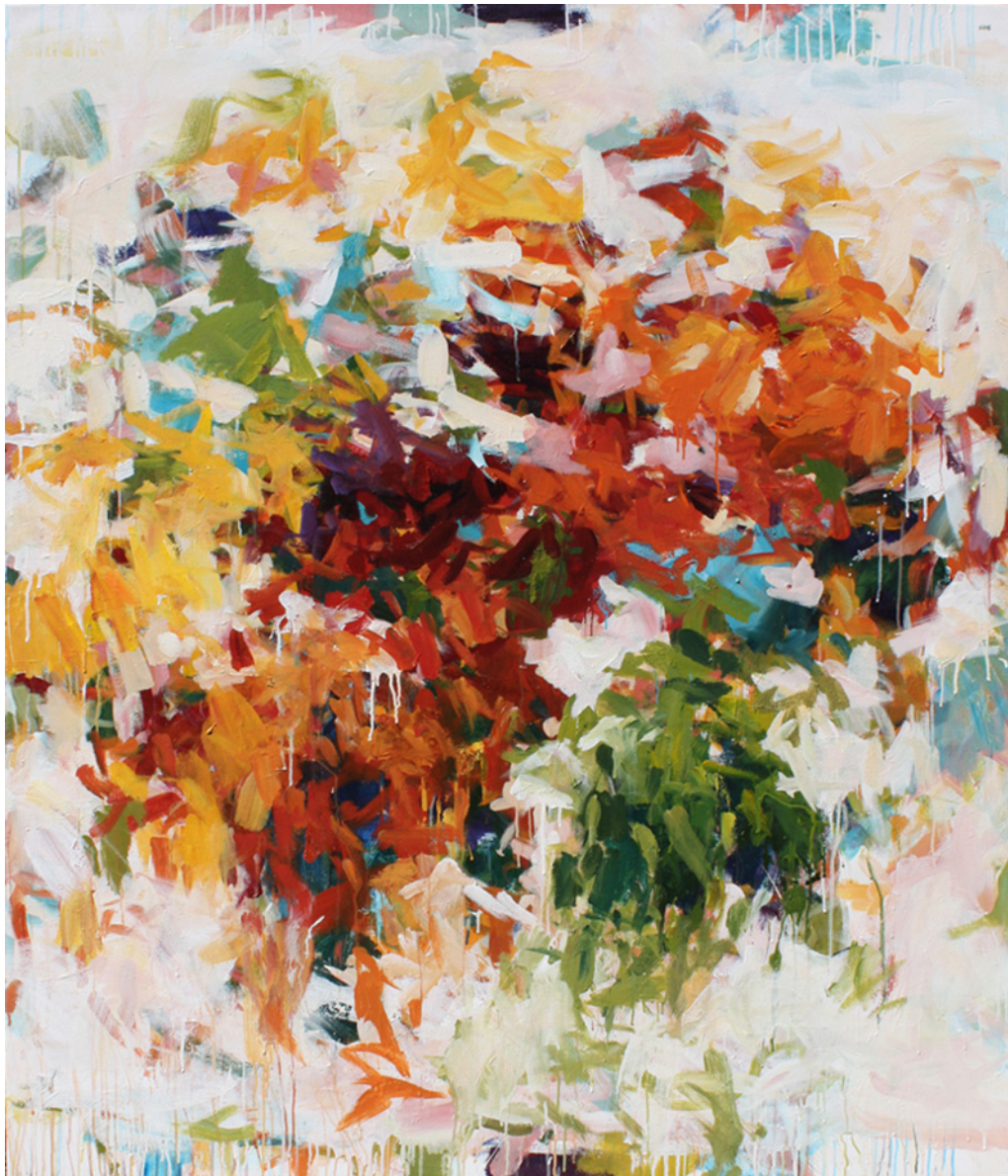
Karen Silve, Market 51 , 2015 acrylic on canvas, 68 x 58 inches